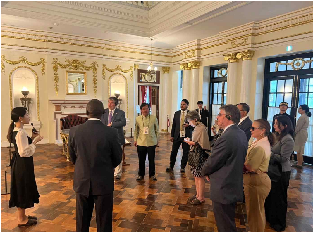
< '밤의 석조전' 체험 모습 >